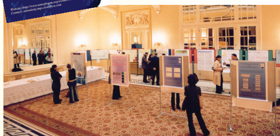
Poster session Casino hall