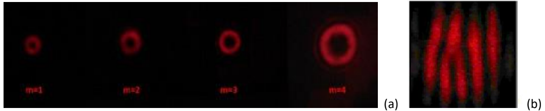
(a) Optical vortices with OAM =1, 2, 3, 4, b) Interference pattern - optical vortex OAM=1 and plane https://granit.imt.ro/email/wave , in an interferometrical set-up (Michelson or Mach -Zehnder)

Images obtain by white light interferometry of the optical components fabricated in IMT.