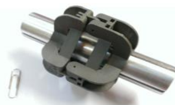
Fluid flow through a fibrous material (H2020) Displacement map of a pressure sensor (ECSEL-H2020) Photo of a torque sensor for automotive (ENIAC)