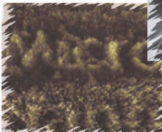
AFM nanolithography: Polarization-patterned PZT film with complex patterns of written words "micro, nano" ( scan area: 1 \times 1 \mu^2 )