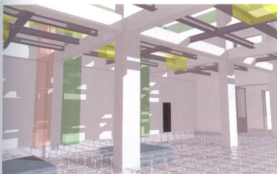
Fig 1. The future CENASIC clean room

located in the clean room and dedicated to research and development processes, innovative technologies and services;